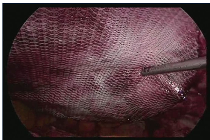
[Table/Fig-3]: Dual mesh secured with transfacial fixation sutures.

Postoperative care: The patients received intravenous fluids, antibiotics and analgesics. Intravenous paracetamol one gram every eight hours was given along with injection tramadol 100 mg intravenous 12 hourly till patient was started on oral analgesics. Additional analgesia was given when needed with twenty micrograms of injection fentanyl. At the time of discharge, similar oral analgesics, paracetamol and tramadol were prescribed. The patients were encouraged early ambulation and started orally as soon as tolerated. The pain was assessed using Visual Analogue Score (VAS) 1 to 10. The patients were followed-up regularly at one month and subsequently at three-month intervals for the first year and then at 6 monthly intervals till the time the results of this study were analysed. The cost was calculated by accounts department by taking into consideration the hospitalisation, operation theater charges, equipment charges, and cost of consumables including mesh and tacker and the cost of medicines.