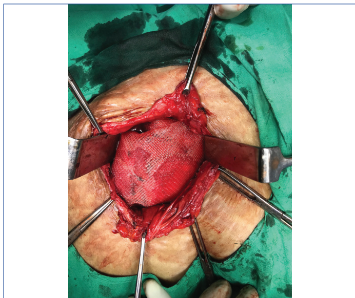
[Table/Fig-1]: Polypropylene mesh secured with suture at the place.

It followed the technique first described by Rives J et al., and Stoppa RE. The procedure consisted of opening the sac and reducing the contents [8,9]. The posterior rectus sheath, or in case of below arcuate line the peritoneum was separated from rectus muscle and approximated in midline with 2-0 polydioxanone sutures. An appropriate size polypropylene mesh to give at least 5 cm overlap all around placed over the posterior sheath and secured with few sutures all over [Table/Fig-1]. The anterior rectus sheath closed over the mesh. The skin was closed without any drains as no or very minimal subcutaneous plane was dissected. Whenever intestinal injury or enterotomy was recognised it was promptly repaired in two layers and saline wash given.